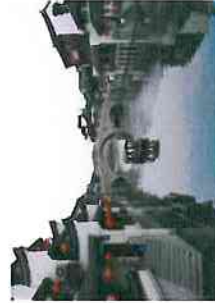
Zhujiujiao Historical Town